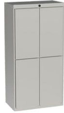
4-DOOR ADD ON