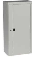
OVERSIZED ADD ON