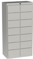
14-DOOR ADD ON