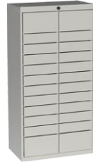
24-DOOR ADD ON