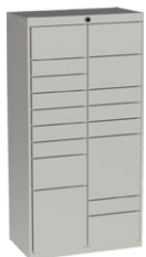
17-DOOR ADD ON